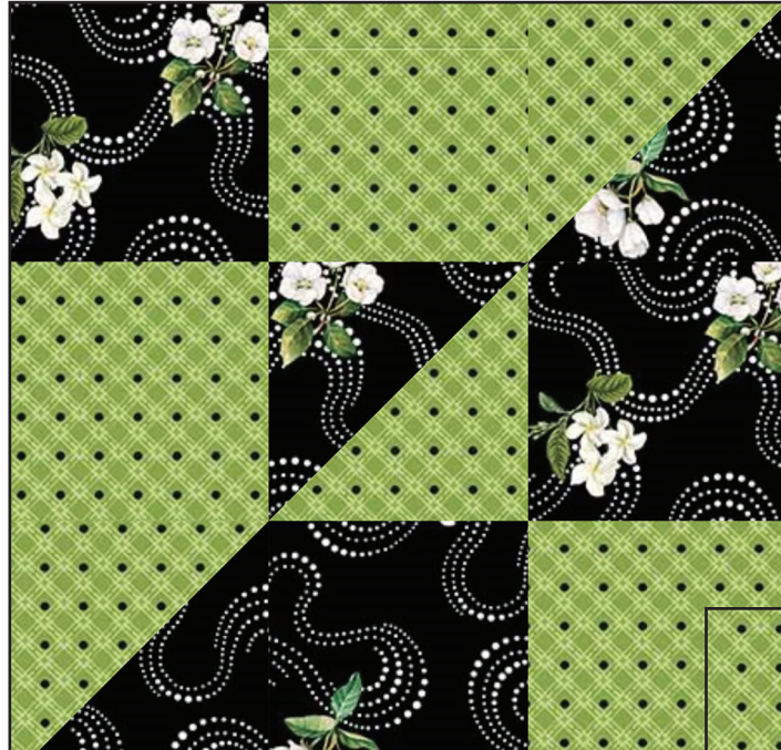
Blocks shown in Bouquet collection DP23090-99 & 23095-74